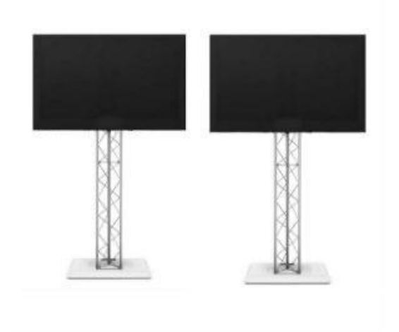
Two Basic TV Setups