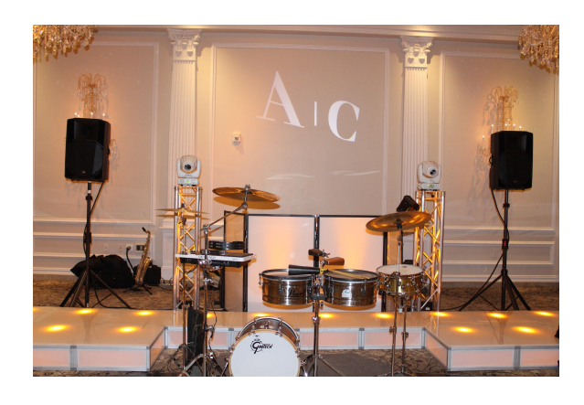
DJ Set Up with Stage